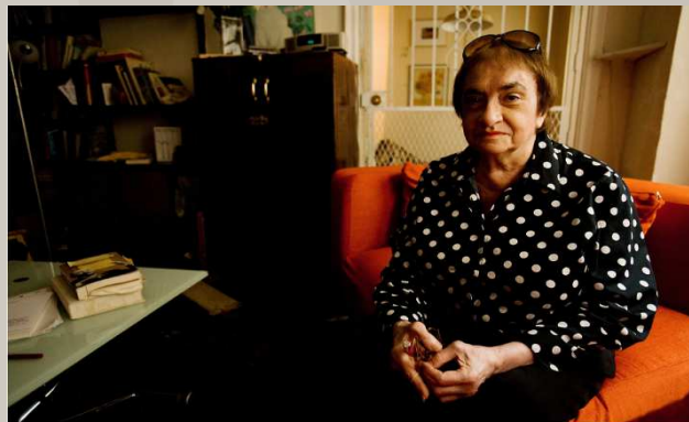
Lee Israel, in 2008, wrote biographies of Tallulah Bankhead, Dorothy Kilgallen and Estée Lauder before turning to crime.

In the early 1990s, with her career at a standstill, she became a literary forger, composing and selling hundreds of letters that she said had been written by Edna Ferber, Dorothy Parker, Noël Coward, Lillian Hellman and others.