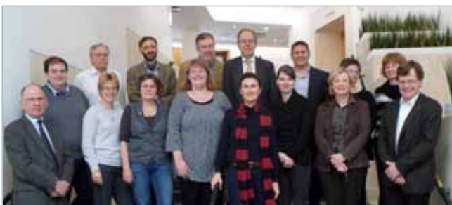
CERL Executive Committee (October 2012)

Certain libraries elect to form groups, sharing the membership fee and nominating one member to vote on their behalf. Groups of up to sixteen institutions still pay no more than € 8,000 per annum. Staff from all member libraries are warmly invited to participate in CERL's Working Groups to guide the development of our services (the HPB, CT, MEI and CP Working Groups), or special interest groups (Manuscripts, Security Network, Bookbinding, Provenance and CERL Promotion).