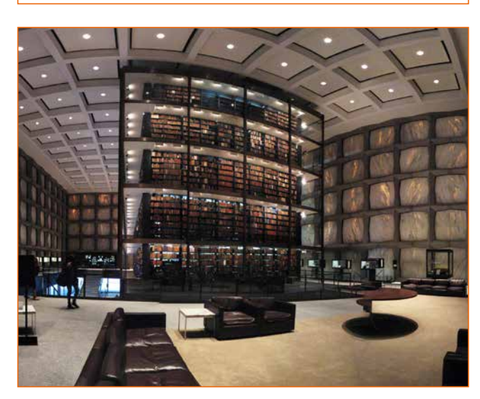
Yale University Libraries

HPB is made available free of charge to readers at CERL member libraries and subscribing institutions.