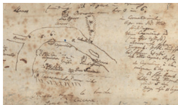
Alexander von Humboldt, Einmündung des Apure und Krümmung des Oronoco Staatsbibliothek zu Berlin – Preußischer Kulturbesitz, Autogr. I/1809