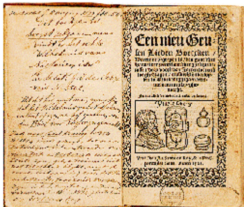
KB 1714 E 20, title page

Work on the collection 1540-1800 of the university library in Utrecht is in progress, as well as the description of the 18 th -century holdings of the Royal Library in The Hague. Also, some 12,000 Dutch editions from the period 1622-1700 in the British Library are being processed. All these descriptions will eventually become available in the HPB. Further information about the STCN file may be found at http://www.cerl.org/hpb/stcndesc.htm .