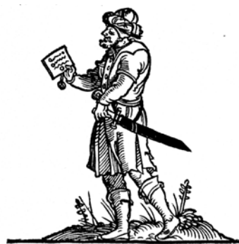
Woodcut depicting the Turkish Ambassador, sent to Vienna in 1537, brandishing his offer of truce. Attributed to Erhard Schoen