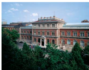
Front view of the MAK façade

The MAK – Austrian Museum of Applied Arts / Contemporary Arts in Vienna positions itself at the interfaces between design, architecture, applied art and contemporary art. Its core competency is engaging with these fields from a contemporary standpoint in order to generate new perspectives and explore borderline areas on the basis of its tradition as an institution. The MAK develops new and intellectually stringent approaches to viewing and understanding its rich collection, which encompasses various eras, materials, and artistic disciplines.