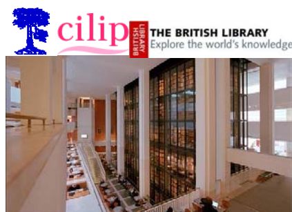
King's Library

Digitisation initiatives around heritage library materials are now underway across Europe. They range from single libraries working with commercial content providers, through to national, Europe-wide and even global programmes. At this one-day conference, we will hear from those involved in the creation of these products and services, and about issues such as funding, licensing models, content selection, product design, and sustainability. We will also hear about the experiences of researchers and educators who use these digital resources in their work.