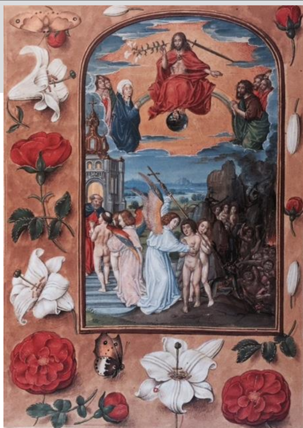
Master of James IV